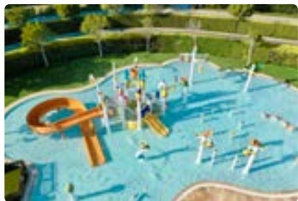
Aqualantis Kids Pool

**Regnum Carya may turn off some of the pool heating systems on certain days due to number of guests, weather conditions and other operational reasons.