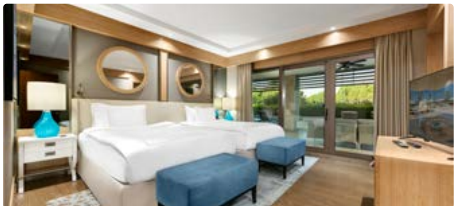
2 nd Bedroom