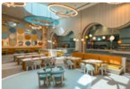
Bamboo Kids World