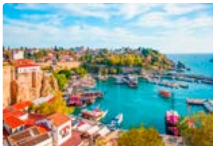
Old Town (Kaleiçi)