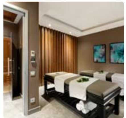
Massage Room & Sauna