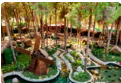
Ali Baba's Farm