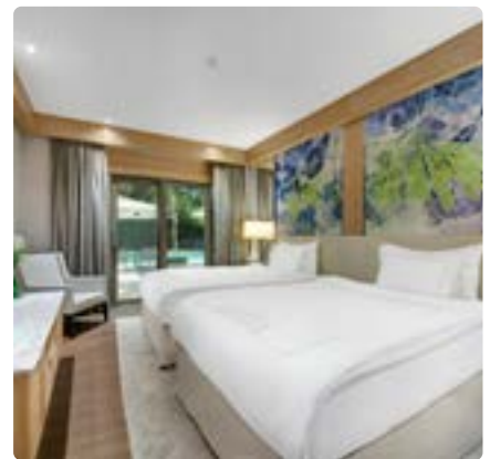
2 nd Bedroom