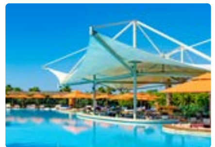
Adult Pool Bar