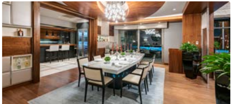
Kitchen & Dining Area