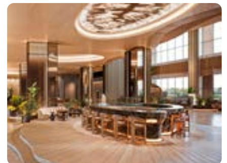
Crown Lobby Bar