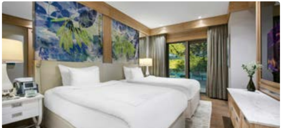
3 rd Bedroom