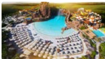
The Land of Legends Water Park