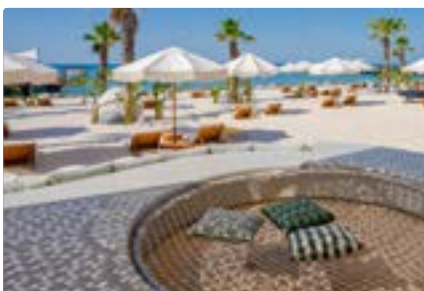
Alia Beach Club

Please note that beach facilities are officially open between May 1 through October 31.