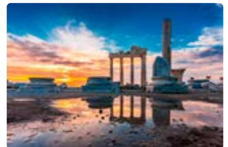
Side Ancient City