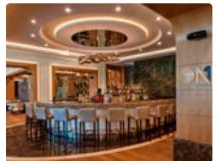
One Lobby Bar