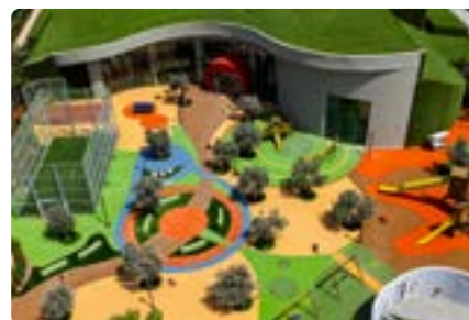
Bamboo Kids World