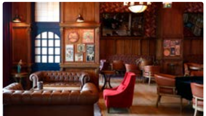
The Shamrock Irish Bar