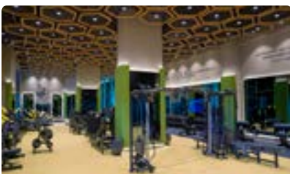
*Extra charges apply.

Yoga, Pilates, Boxing, Kickboxing, Weight Training, Functional Training, HIIT, LIIT, Cardio Training, Sport Specific Training (golf, tennis, football), Stretching, Kinesis Workouts