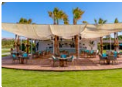
Palm Beach Club