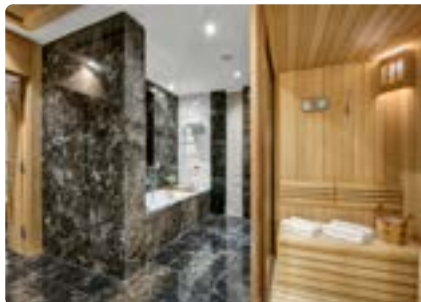
Bathroom & Sauna