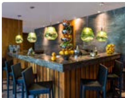
Zing Vitamin Bar