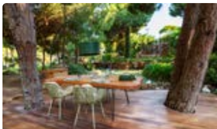
Ubon Thai Cuisine