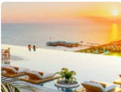
Seven Rooftop Pool