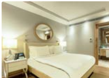
Bedroom (King Bed)