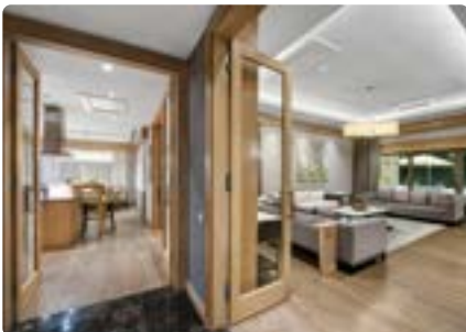
Living Room & Separate Kitchen

*Please ask your assistant for pool heating and cost information.