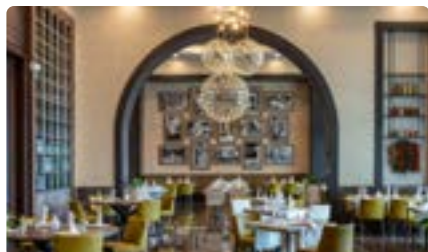
Ristorante Tramonto Italian Restaurant

*Reservation is required. Dress code is smart casual. No age restrictions. All à la carte restaurants are extra charge for meeting and football groups. Restaurant and bar operating hours or days may change due to adverse weather conditions, technical reasons and guest requests.