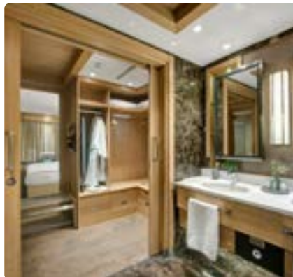
Dressing Room & Bathroom