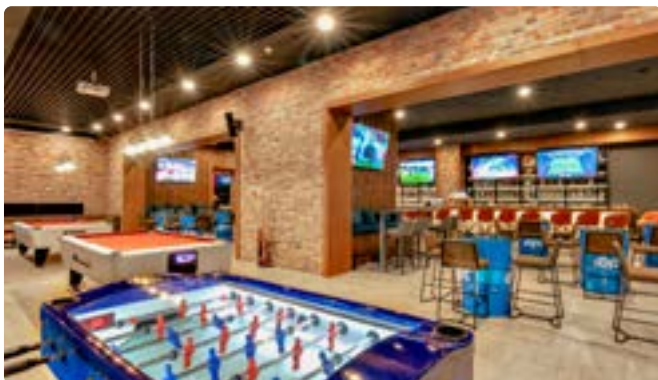
Score Sports Bar

*Wall's in UK / Inmarko in Russia / Langnese in Germany